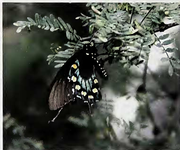
Figure 1. A B. philenor perched after sunset and illuminated with only indirect solar radiation. Even without the solar orb present in the sky, the blue iridescence of the ventral hindwing is visible.

We aimed to better understand how aggregations may reduce the risk of predation as well as the environmental conditions under which the warning coloration may be used by pursuing answers to four questions. First, do aggregations form and disband at times of day when visually hunting predators are active and when the warning signal is effective? If so, we expect that butterflies would aggregate before sunset or when ambient light is still available and disband after sunrise. Second, do aggregations form in locations that facilitate learning and recognition? To facilitate learning and recognition, we expect butterflies to perch in locations that make them conspicuous. Third, do butterflies position themselves in a way that increases the size of the warning signal? If so, we predict that the butterflies will orient themselves so that more wing surfaces are visible to an approaching predator. Finally, does the size of aggregations indicate that the butterflies aggregate to facilitate warning signal learning? If this